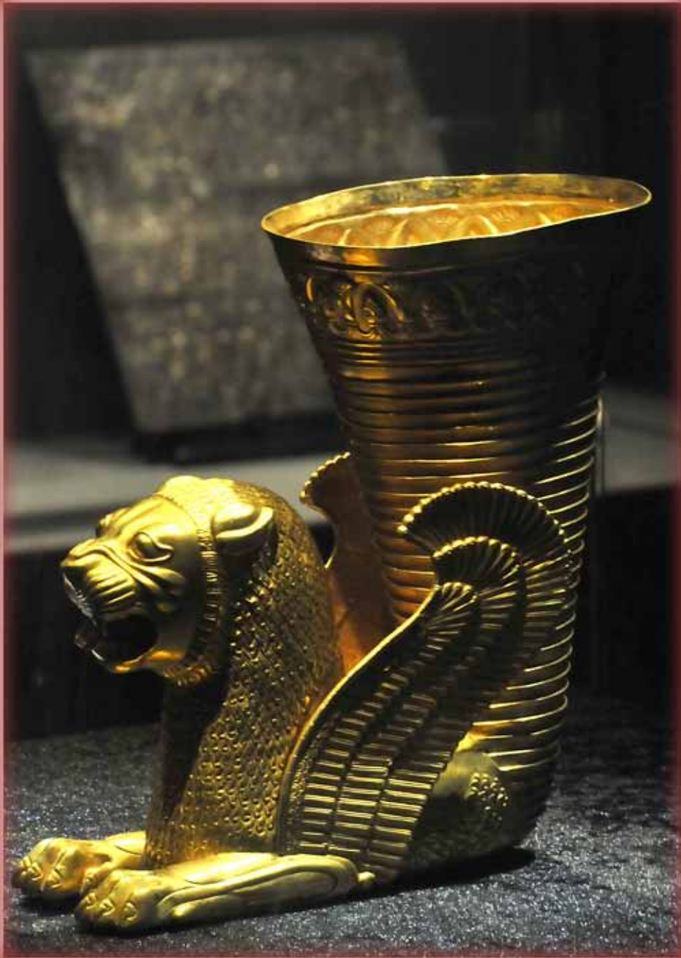
gold rhyton. Hamedan. Achaemenid period.