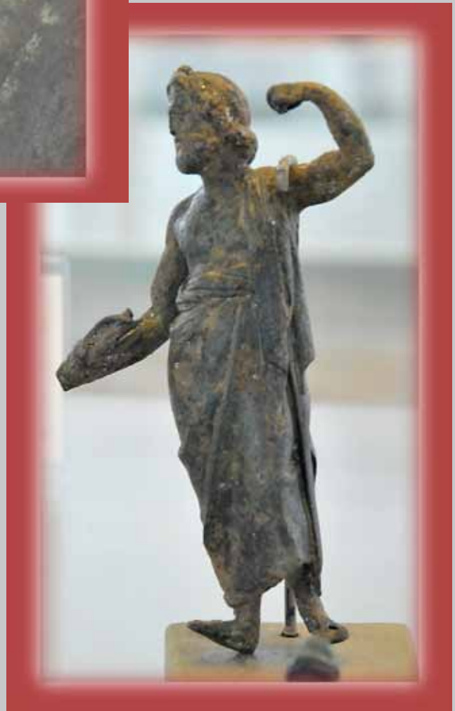
Zeus. Nahavand - Hamedan. Seleucid period.