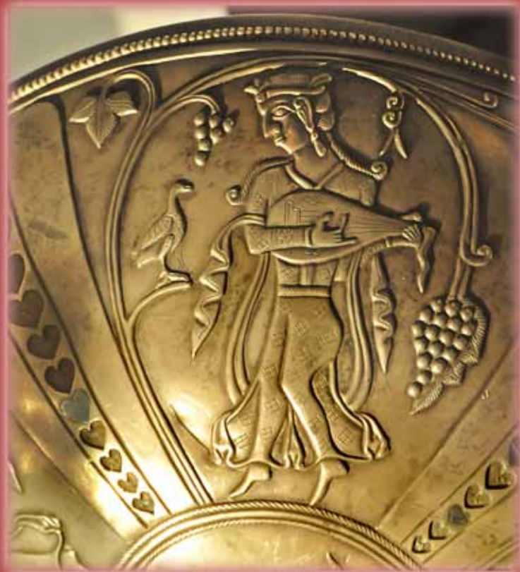
Silver bowl (detail). Klardasht - Mazandaran. Sasanian.