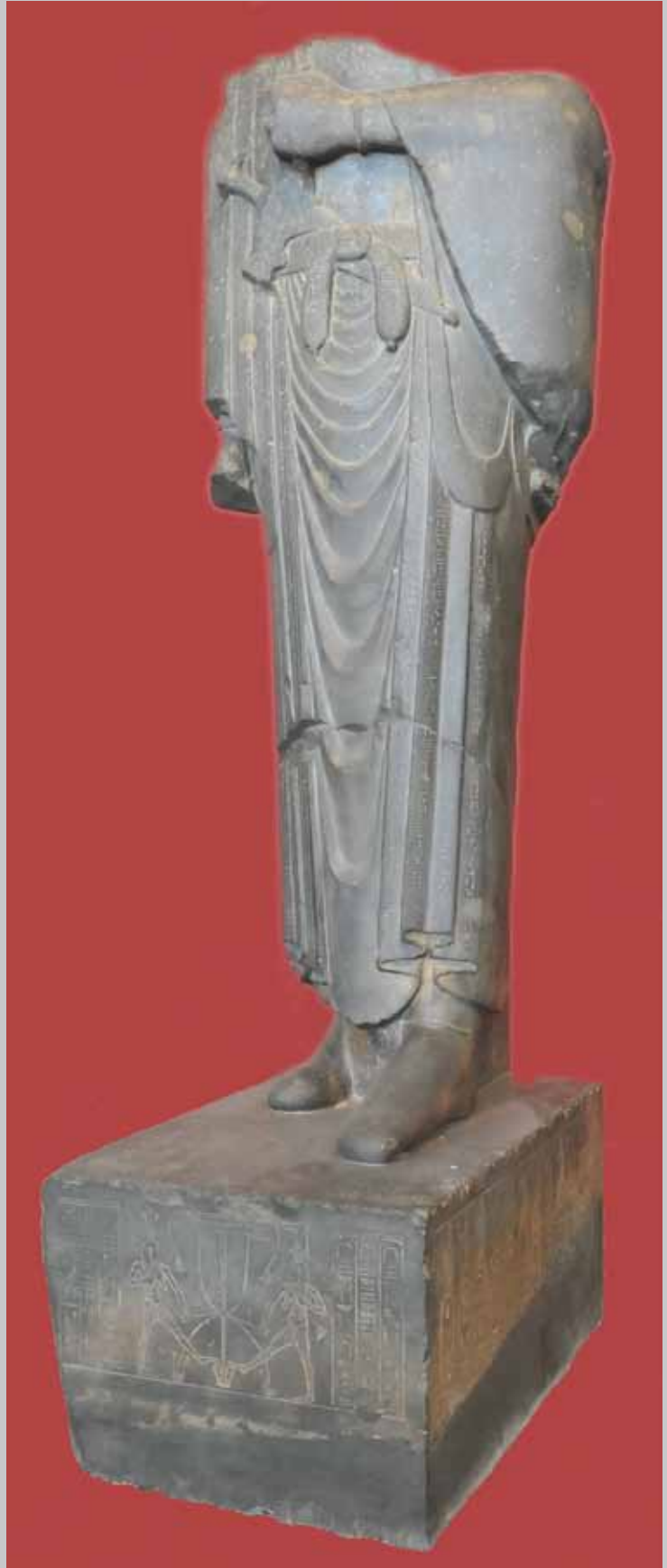
Statue of Darius I, with inscription on base in Egyptian hieroglyphs. Found at Susa. 6th-5th century BCE.