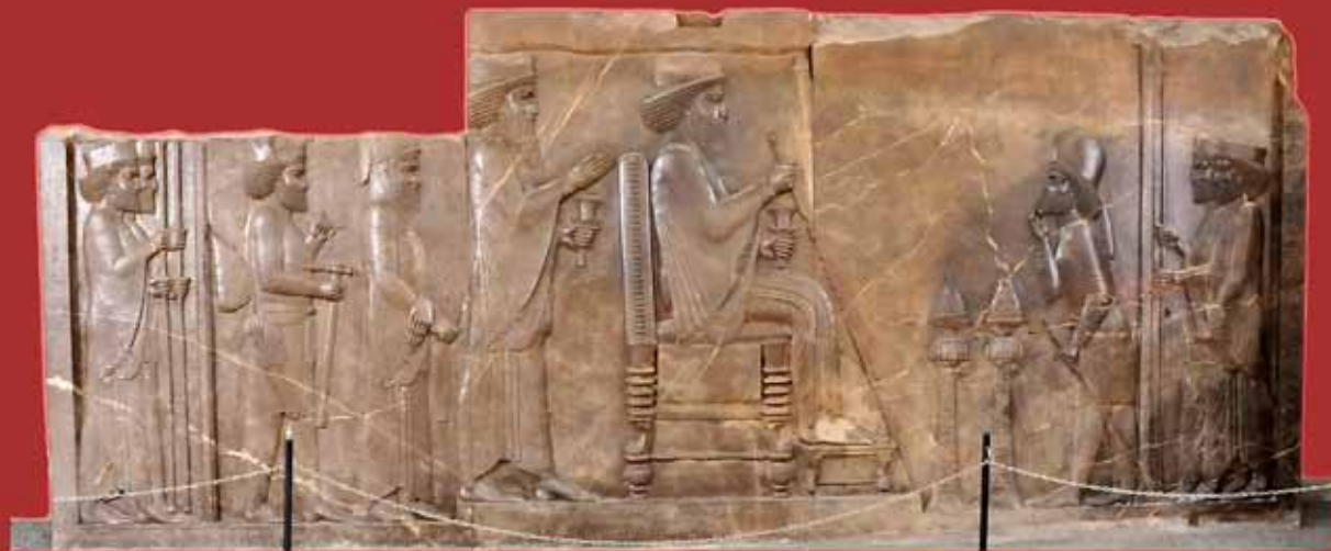
Audience hall scene depicting Darius I or Xerxes I, Treasury Palace, Persepolis. 5th century BCE