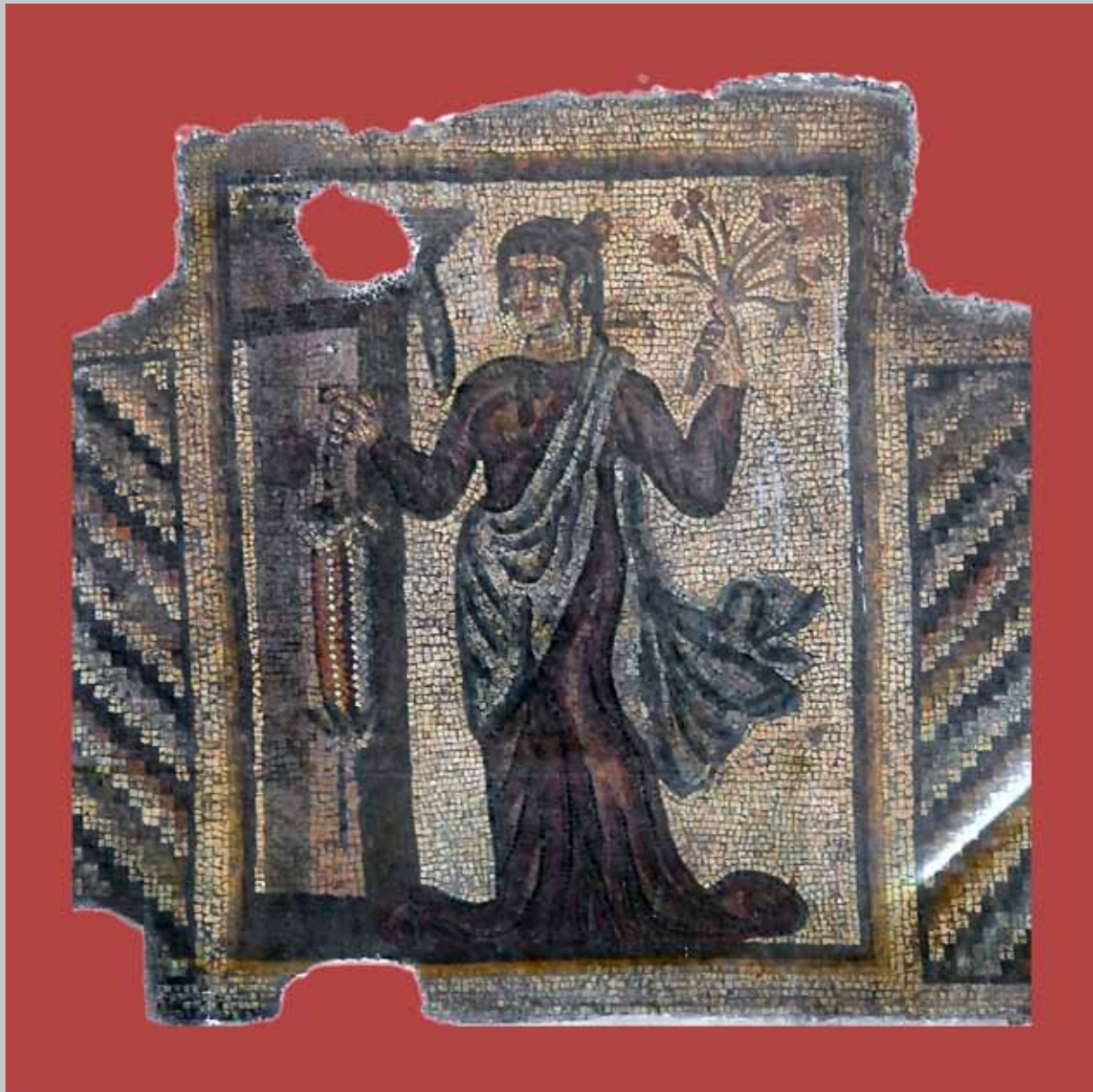
Floor mosaic (fragment). Shapur's palace, Bishapur – Fars. 3rd (?) century CE.