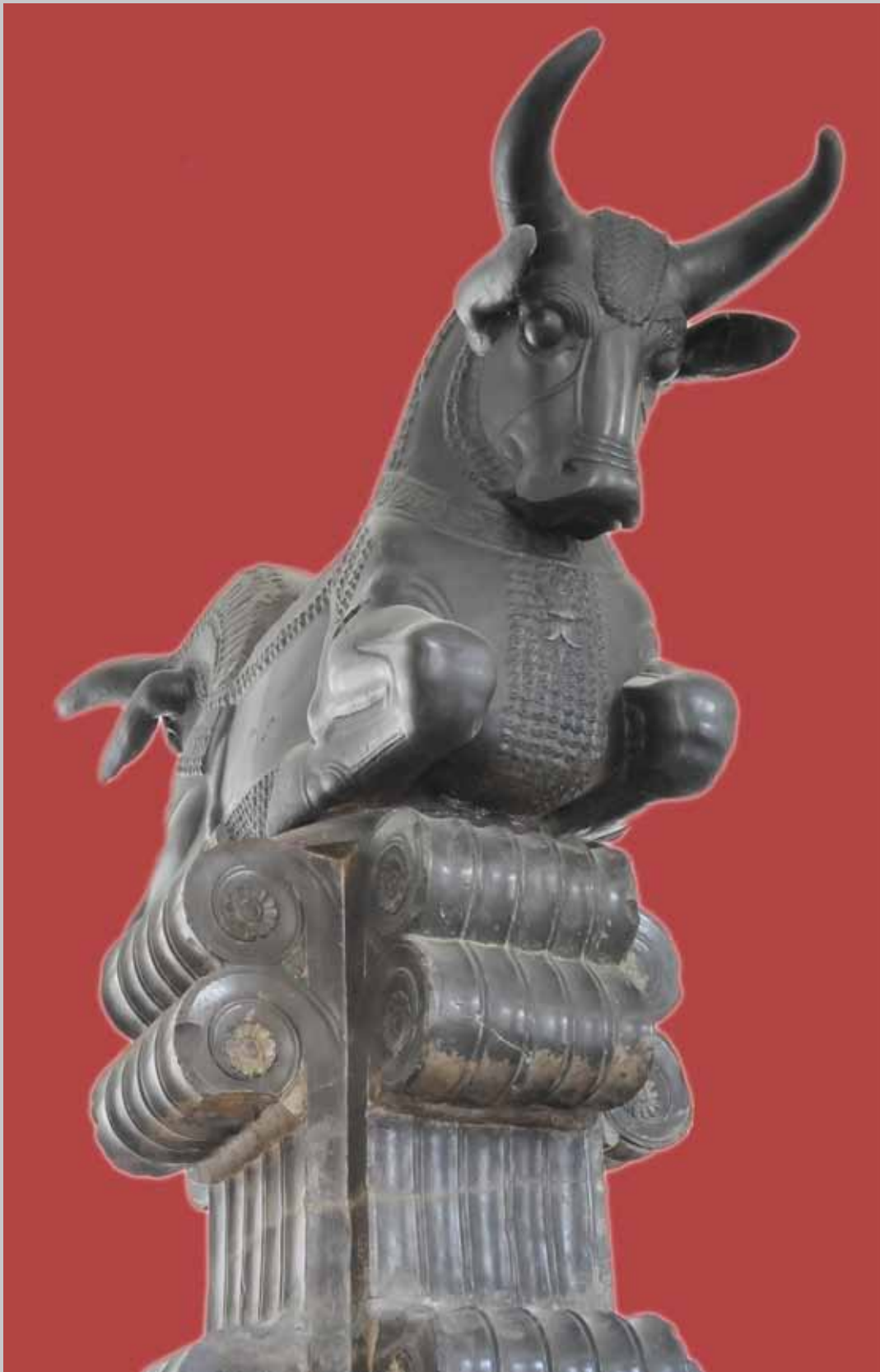
The upper part of a stone capital from Persepolis. 5th century BCE.