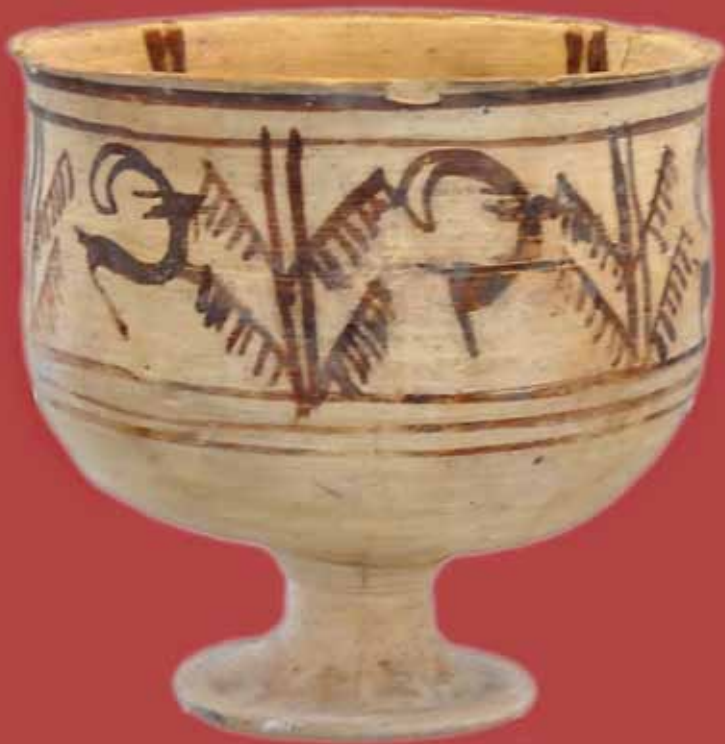
Footed pottery vessel. Shahr-e Soukhteh - Sistan. Late 3rd millennium BCE