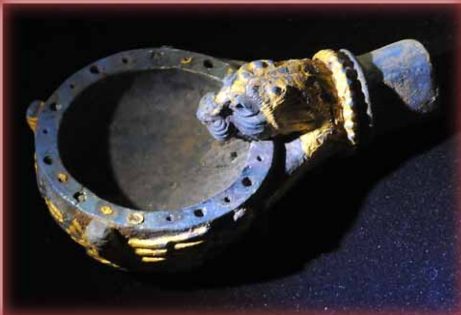
Lapis lazuli vessel encrusted with gold. Hasanlu - West Azerbaijan. Early 1st millennium BCE.