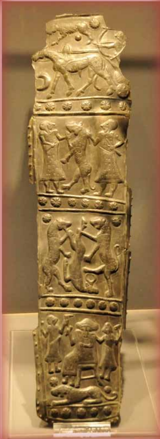
Bronze quiver. Sorkh dom - Luristan. 800-700 BCE