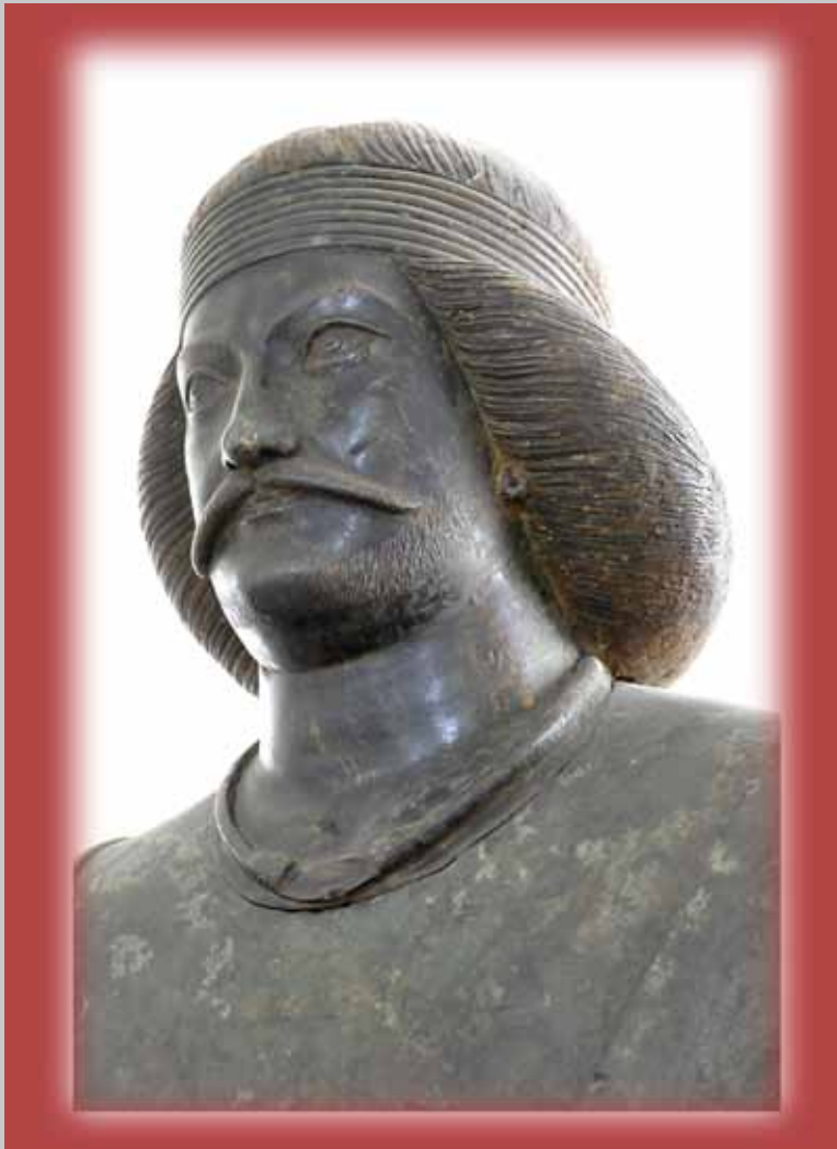
Bronze statue of Parthian prince. Shami - (Izeh) Khuzistan.