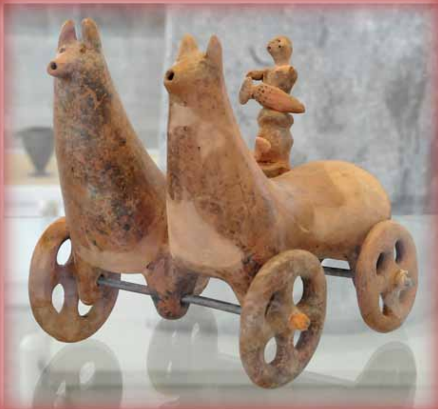
ceramic charioteer. Amarlu - Gilan. 1st millennium BCE