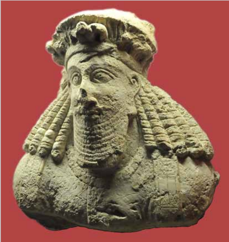
Stucco bust. Hajiabad - Fars. Sasanian.