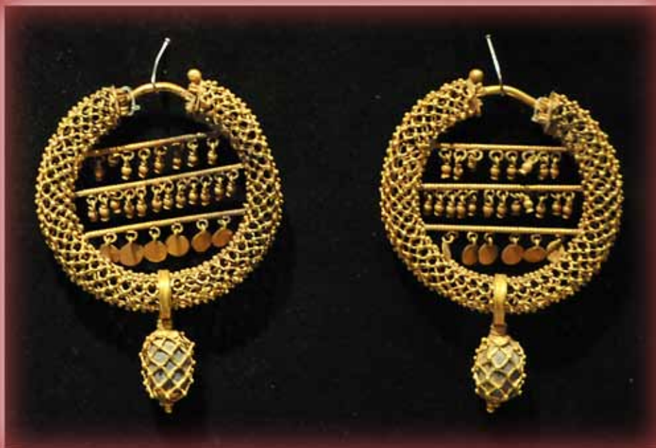
Gold earrings. Pasargad - Fars. Achaemenid period.