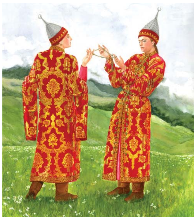
Fig. 2. A female costume from Belorechenskaia Kurgan 20. Reconstruction by Zvezdana V. Dode, drawing by Irina P. Oleinik.

It would be hasty to reject the notion of a weaving industry in the Crimea that could satisfy the needs of the ordinary population and produce simple silk fabrics for export. However, there are no grounds to discuss the presence of highly specialized local weavers there. And thus, more specifically, there is no basis to place workshops in the Crimea, namely in Kaffa, that could have woven the complex silk fabrics found in the Belorechenskaia kurgans.