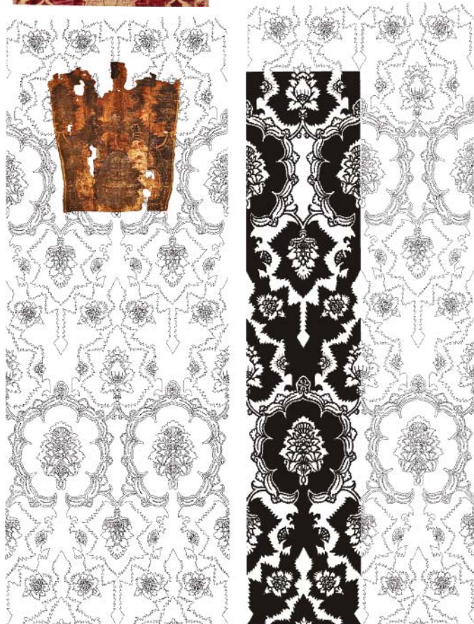
Fig. 5. The Belorechenskaia textile. Reconstruction by Z. V. Dode based the surviving fragments (published in Lo Stile dello Zar [Milano: Skira, 2009], p. 152, no. 44).

Silks with Italian designs, where the main pattern is the same flower as the one in the Belorechenskaia velvets with ogivally arranged leaves and artichoke motifs, can be found in the paintings of the Northern Renaissance artists, specifically in works by Jan van Eyck, Petrus Christus and Hans Memling. Two works of Hans Memling, St. Catherine (early 1480s) (Fig. 7, next page) and the Madonna with Child and Angels (after 1479) (Fig. 8) depict the same velvet fabric covering the throne. The main ornamental motif in it is a large flower with ogival leaves. The complex elements on either side of the flower and artichoke motifs fully match the décor of the Belorechenskaia fabric (Fig. 9). Such a detailed reproduction of ornamental elements was possible only when an artist had the real fabric in front of him. Another parallel gives a representation of a kaftan embroidered on the tomb cover of Maria of