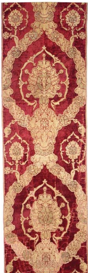
Fig. 4. Venetian velvet of the late 15 th century. The Metropolitan Museum of Art, New York. Rogers Fund, 1912 (12.49.8). Reproduced with the kind permission of the museum.