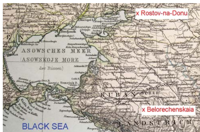
Fig. 1. Map showing location of Belorechenskaia.

Fifty years after Veselovskii’s excavations, the Belorechenskaia materials were studied by Varvara P. Levasheva (1953). However, her work was limited to general descriptions of burial rite and goods, without a detailed analysis of each grave’s assemblage as a complex of interrelated objects. Levasheva named the places of origin for several different fabrics but did not provide any supporting reasons. She came to the conclusion that “...fabrics found in graves are of only luxurious types. Almost all of them are of Oriental origin, with a majority produced in Iran, though Italian fabrics were used for a caftan from a female grave. Quite frequently there was also Chinese silk resembling kamkha” (Levasheva 1953, pp. 192–93). She offered reconstruction drawings of two sets of dresses. Accompanied by the descriptions, the information given on the dresses’ cut has been taken for granted by other scholars and referenced in their publications (Ravdonikas 1990, pp. 70–71, Fig.19; Kramarovskii and Tepliakova 2009, pp. 29,