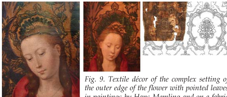
Fig. 9. Textile décor of the complex setting of the outer edge of the flower with pointed leaves in paintings by Hans Memling and on a fabric from Belorechenskaia.

Mangup, where the cut of the cloth and décor of the fabric are similar to the those found in kurgan 20 (Fig. 10).