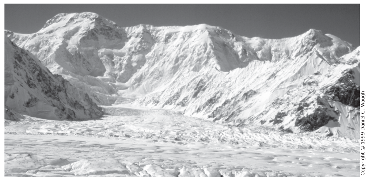
Pik Pobedy (Mt. Tomur) in the Tianshan on the border between Kyrgyzstan and Xinjiang