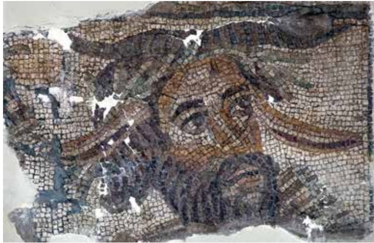
Mosaics from the floor of the Bishapur "palace" now displayed behind dusty glass in the National Museum, Tehran.