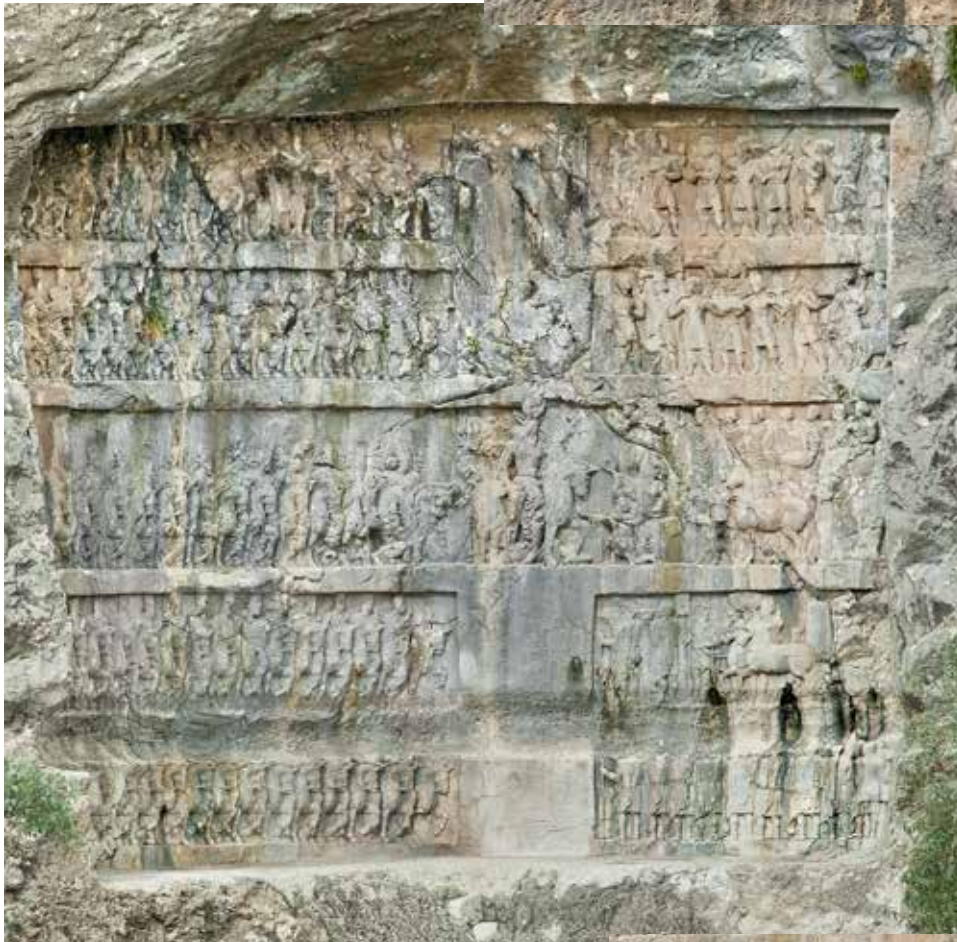
Bishapur 3, the third of Shapur I's reliefs proclaiming his victory over the Romans. Shown in its setting on the right bank of the river. The image in the middle is a large composite from across the river; the details at bottom show the damage caused when an irrigation pipe was constructed along the cliff base in the 19 th century.