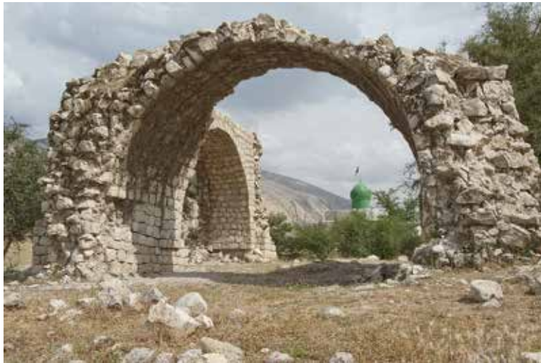
Remains of a fire temple that had a huge dome.