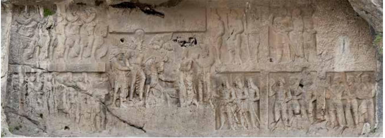
The Bishapur 2 relief on the left side of the river, depicting in the center Shapur I presumably as he takes the Roman Emperor Valerian captive and accepts submission of Philip the Arab, while his horse is trampling the body of Emperor Gordian III. The upper image is a composite.