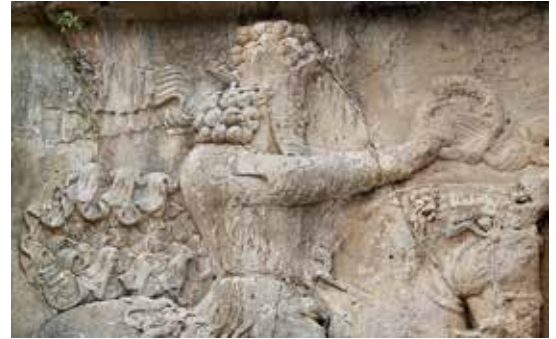
Below and right: Bishapur 5. Investiture of Bahram I (r. 271–74).