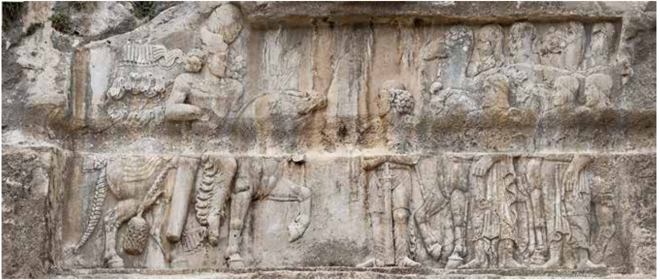
Bishapur 4: Bahram II (r. 274–93) receives submission of a delegation of Arabs. The 19 th -century irrigation pipe cut through the middle of the relief.