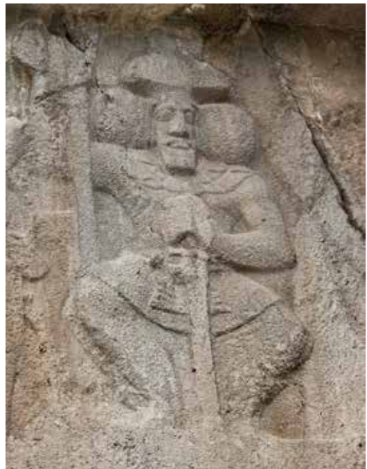
The area along the river below the reliefs is a popular picnic spot today.