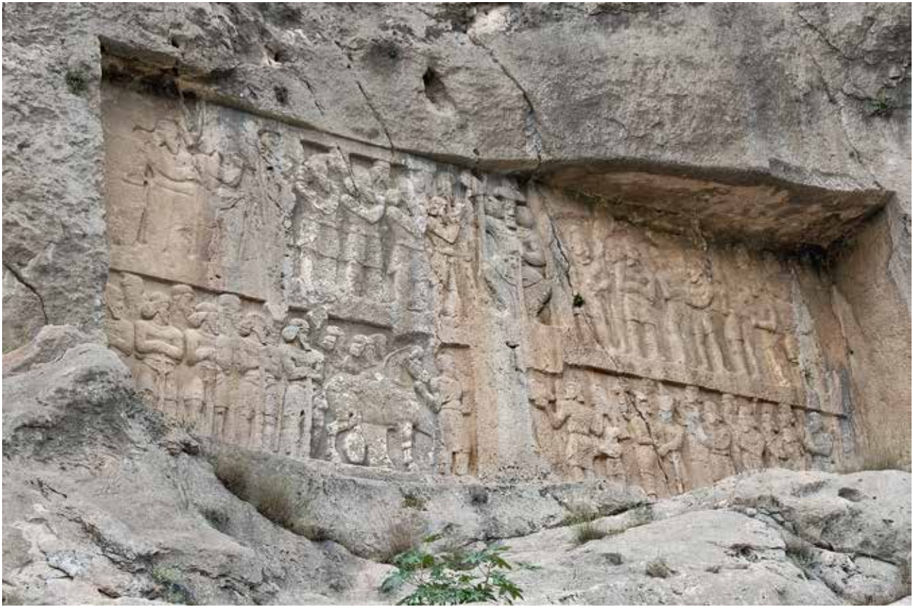
Bishapur 6, difficult to photograph except at an angle, depicts Shapur II (r. 309–79) receiving tribute in a victory ceremony.