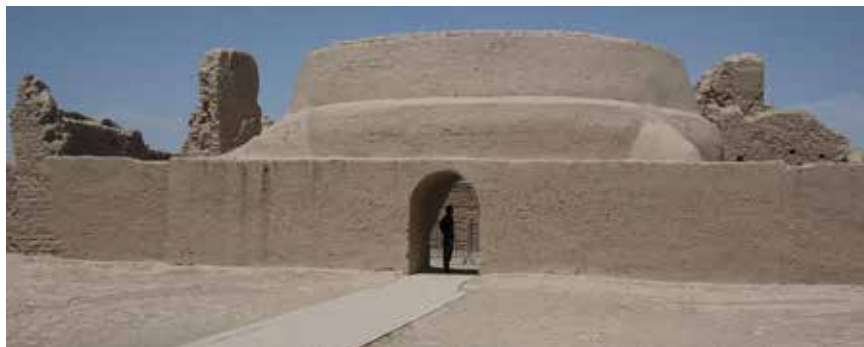
Fig. 5. Kocho/Gaochang, Ruin β, Hall I, as reconstructed, from the west.

to their contribution on Ruin β. The importance of Ruin K is related to the fact that it preserved some Manichaean wall paintings and was at least near the location of the “library” that included Manichaean manuscript and banner fragments brought back both by the German expeditions and (to a lesser degree) by Stein. Unfortunately, the deterioration of the site means that reconstructing details of the architecture is very problematic.