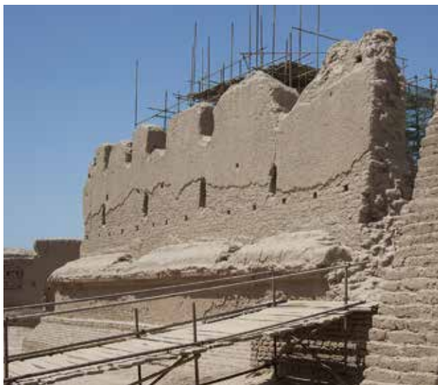
Fig. 4. Kocho/Gaochang, Ruin β, outer wall of Cell A.

ic photos with modern ones taken from the same vantage points is instructive in part for what we can see about how recent “restoration” has been undertaken that in the process now makes it impossible to do further study of what lay underneath. The noteworthy example of this is the rebuilding of the Hall I, with its rounded upper elevation that culminated in a dome (the dome itself not re-created, at least not yet...) [Fig. 5].