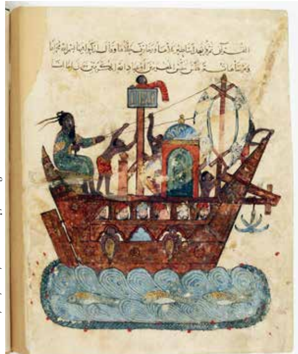
Fig. 3. Manuscript page from the al-Maqāmāt al-ḥarīriyah ( The assemblies of al-Hariri ), copied and illustrated in 1237 by Yahya ibn Mahmud al-Wasiti. Bibliothèque nationale de France , MS Arabe 5847, fol. 119v.