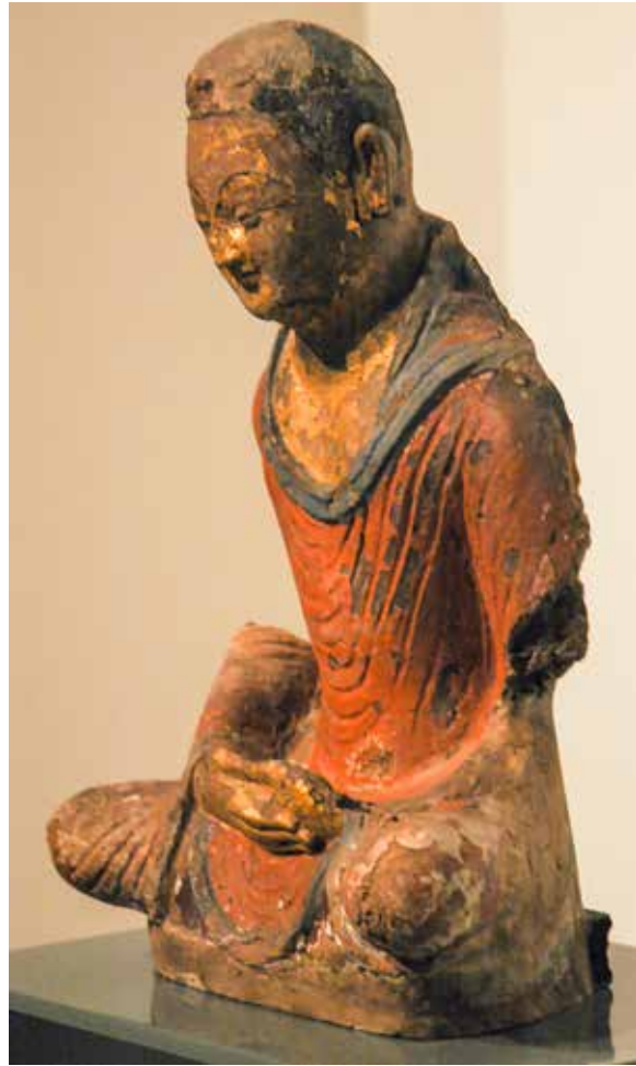
Fig. 6. Clay statue of the Buddha from Kocho Ruin Q. Collection of Museum für Asiatische Kunst, Staatliche Museen zu Berlin.