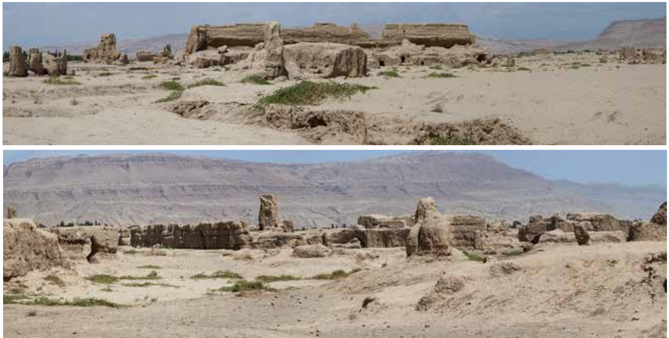
Figs. 1, 2. Panoramas of Gaochang/Kocho, taken in July 2008.