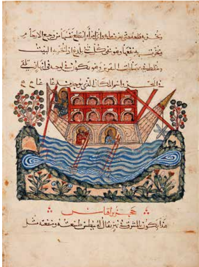
Figs. 1, 2, 4 and 5 are all photographs by Pernille Klemp; copyright The David Collection, downloaded from the museum's website.

Image source: https://www.davidmus.dk/files/3/5/371/Coyright_5-1997_recto-The-David-Collection.-Copenhagen-Photo-Pernille-Klemp_web.jpg