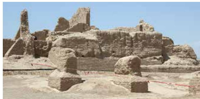
Fig. 3. Kocho/Gaochang, Ruin β, Temple A, Block E from the east.

Caren Dreyer (who has been mining the expeditions' archival records—see the review in The Silk Road 14 [2016]: 236) and Ines Konczak-Nagel provide a lavishly illustrated overview of the "Architecture of the Great Monastery, Ruin β" (69-80), where the use of wooden architectural elements has to be documented indirectly by analysis of such things as holes in the mud-brick walls that would have accommodated beams [Figs. 3, 4]. The juxtaposition here of the histor-